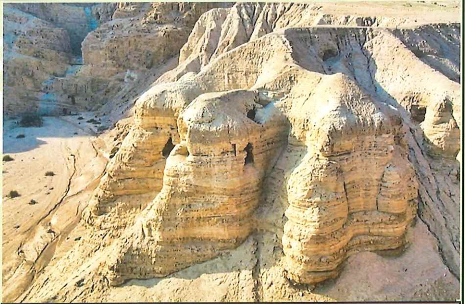
The above photo was taken at Qumran which is just west of the Dead Sea. In the caves the Dead Sea Scrolls were discovered in 1946.

Over time I have occasionally written about the amazing qualities of the natural world. I remember an article about the transformation of trees as they shed their leaves as winter approached; or the absolute precision of our solar system as we travel around the sun on our yearly journey providing seasons essential for life. Uniqueness, however, is not just a quality exclusive to the natural world. It is also the quality of a book; the Bible.